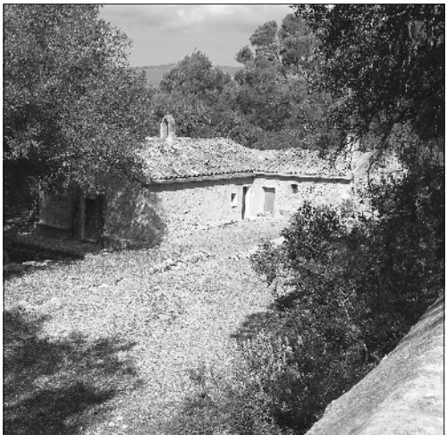
Is it a bird? Is it a plane? No – it’s a submarine!

Some restoration work has been done on this beautiful old building. It’s a pity (though understandable) that the entrance is locked. However, walk over to the far side for a view of the grounds.